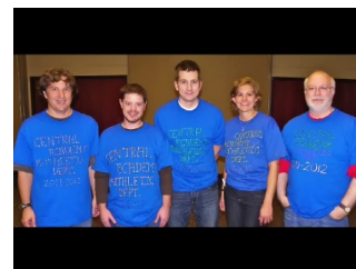
Central Academy math teachers at the Platteville Math Competition

Central. "The problems on this contest are a challenge for most of us to read, let alone solve. Nonetheless, our students earned the highest score on six of the fifteen questions."